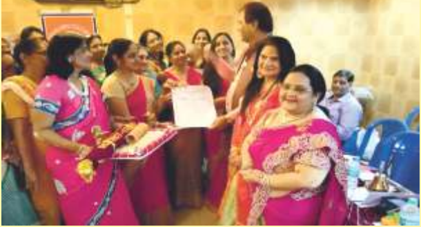
Charter Presentation by IP to Alliance Club Of Ragini sponsored by Alliance Club Of Hansini