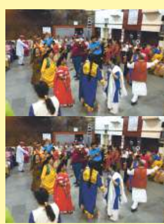
Alliance Club of Surat Sunflower, District 141 celebrated 'Raas Garba'. All the club members enjoyed the function.

Alliance Club of Surat Sunflower, District 141 donated sewing machine to a poor needy woman to earn for her family.