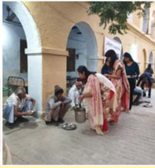
Alliance\ Club\ of\ Agra,\ District\ 150\ served\ food\ and\ necessary\ items\ at\ Kushth\ Ashram,\ Near\ Shilpgram,\ Tajganj\ Agra\ on\ 25/11/2018\ .