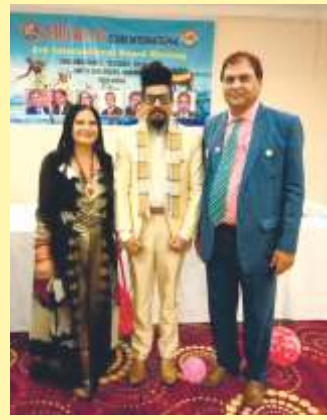
With Newly Appointed District Governor of New District at Colombo, Srilanka, Ally Revolutionizer Ishri