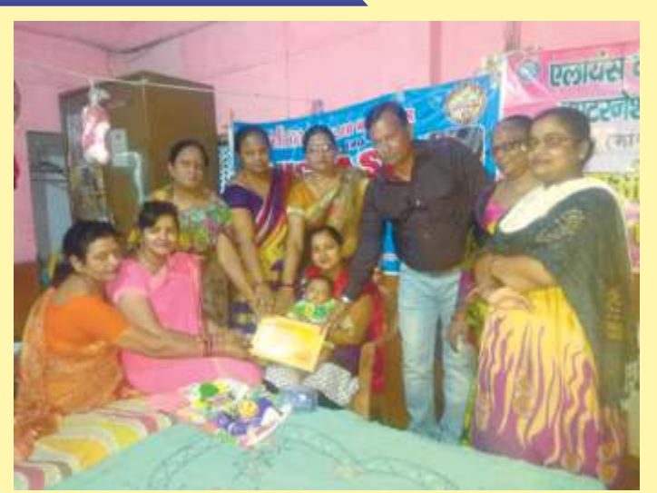
Alliance Club of Jigyasa, District 180 felicitated parents a New Born baby girl under the project of 'Beti Bacho Beti Padaho'. They gifted sweets, cap, cloth, towel, shoes, toys & certificate.