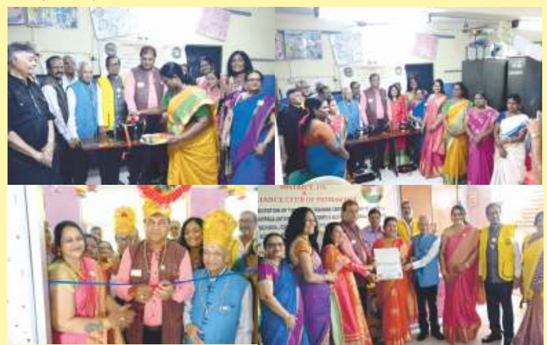
Inauguration of Alliance Sewing Training Centre at Chennai Alliance Club Of Premajali District 141