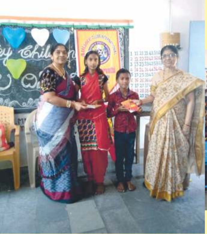
Alliance Clubs International, District-192distributed Pens, Notebooks and Sweets on the occasion of Children's Day