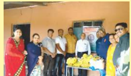
Alliance Clubs International, District 121 went to an old age home and distributed fruits and food items to the inmates.