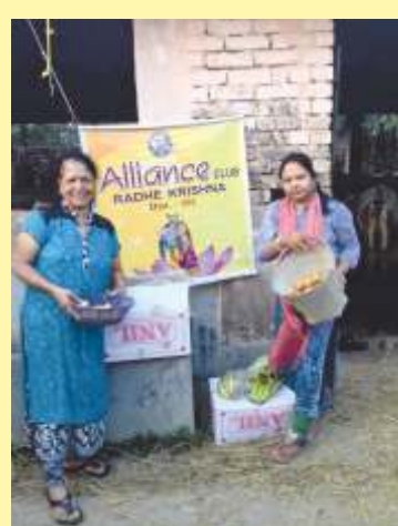
Alliance Club of Radhe Krishna, District 101 fed cows at Barupur Dhyan Foundation Gowshala.