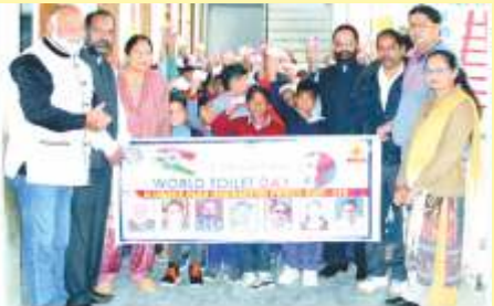
Alliance Club International, District 119 organized an awareness rally on the hand wash by students of GP School, Piplanwala.