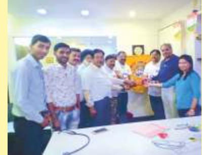
Alliancee Club of Indore Masti, District 121 donated Insulin pens to 10 diabetess at free of cost.