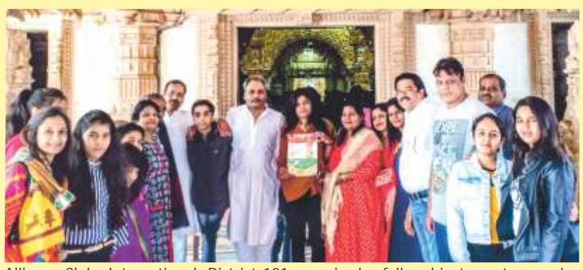
Alliance Clubs International, District 121 organized a fellowship tour at a nearby temple and visited there.