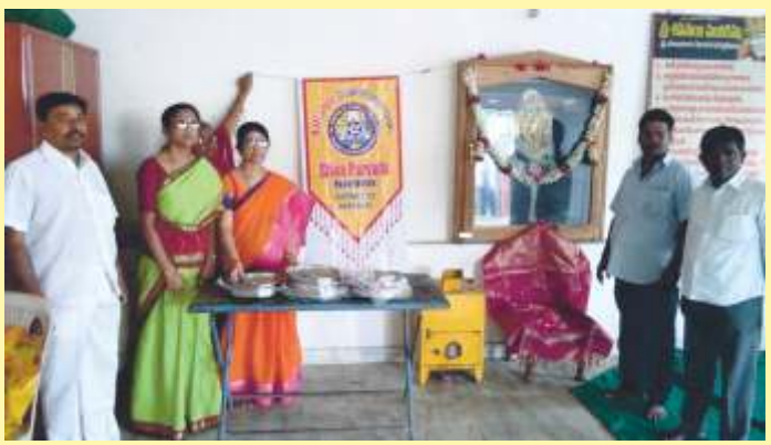
Alliance Clubs International, District-192, donated Meals Plates to the Saibaba Temple for Annadhanam Program.