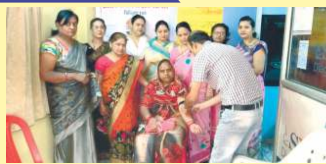
Alliance Club of Bina Shakti ,District 108 organized a camp for group examination. 120 people were benefitted in this camp.