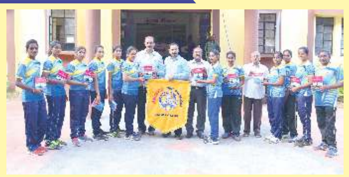
Alliance Clubs International, District-192 presented a Handbook of Career Development to Sports Girls at Kakatiya University.