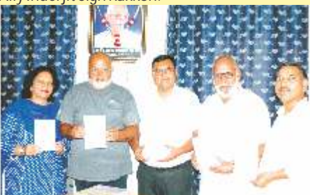
Alliance Club Hoshiarpur Greater, District119 organized seminar on "Panchkarma Cup Therapy" and released a booklet on "Veda Bharat Ki Pehchan"