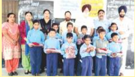
Alliance Club of Kakkon ,District 119 distributed Winter Uniforms to Needy Students of Govt. Primary School, Kakkon.