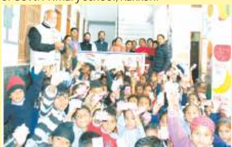
Alliance Club of Hoshiarpur Prince, District 119 distributed soaps to all student on the occasion of World Toilet Day in Govt. Elementary School, Piplanwala, Hoshiarpur.