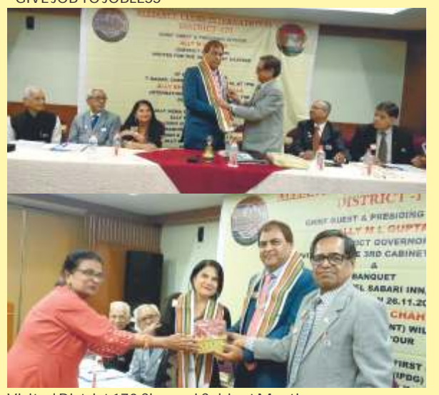
Visited District 170 Chennai Cabinet Meeting