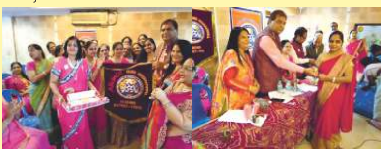
Charter Presentation by IP to Alliance Club Of Ragini sponsored by Alliance Club Of Hansini