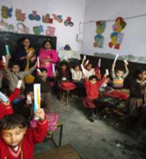
An Eye and Health checkup camp was organized by Alliance Clubs of Faridabad Green and Jagriti, District 150 in slum area school. Total 315 OPD were done by Doctors team.