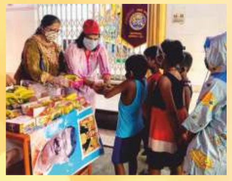
Alliance Club of Sanskaar, District 101 spent quality time with children and served them food, chocolates etc.