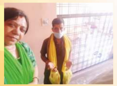
Alliance Club of Vidisha Alankrita, District 108 provided ration and cooked food to needy persons.