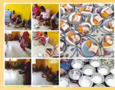
Alliance Club of Jagriti, District 101 served breakfast to special children in Prabhatak Sangh Home.