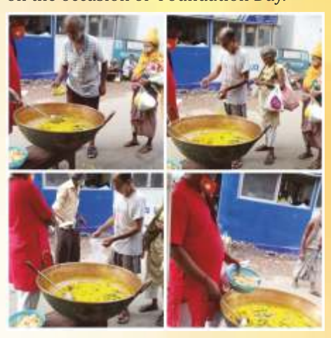
Alliance Club of Jagriti, District 101 distributed Khichdi in Kalighat on 16<sup>th</sup> October.