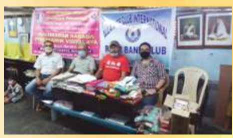
Alliance Club of River Bank, District 101 distributed food and new clothes to the children of Baghbazar Sarada Prathamik Vidyalaya.