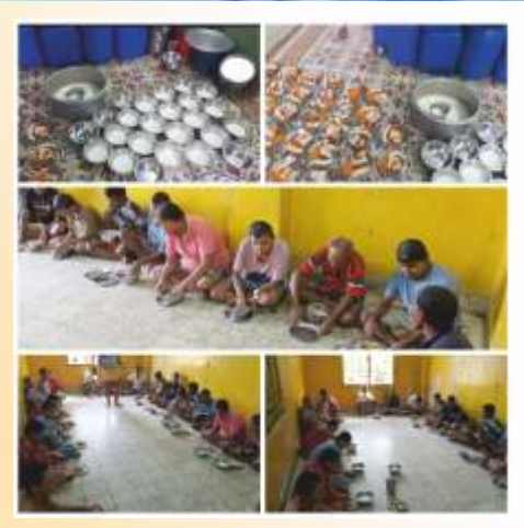
Alliance Club of Jagriti, District 101 distributed breakfast to special children of Prabhatak Sangh Home on 22<sup>nd</sup> October.