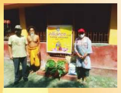
Alliance Club of Radhe Krishna, District 101 fed cows at Sri Kapilmuni Ashram.