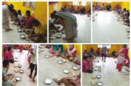
Alliance Club of Jagriti, District 101 distributed food and distributed breakfast to special children of Baghbaza of Prabhatak Sangh Home on 18<sup>th</sup> October. Prathamik Vidyalaya.