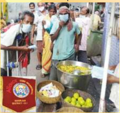
Alliance Club of Sanskaar, District 101 distributed cakes, khichdi, fruits to needy people.