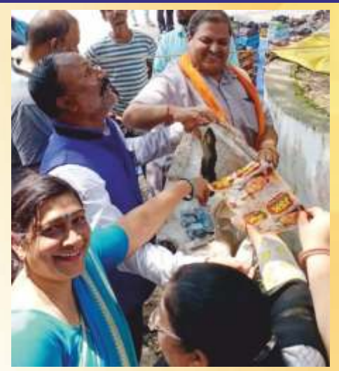
Alliance Clubs International, District 167 organized a cleanliness drive.