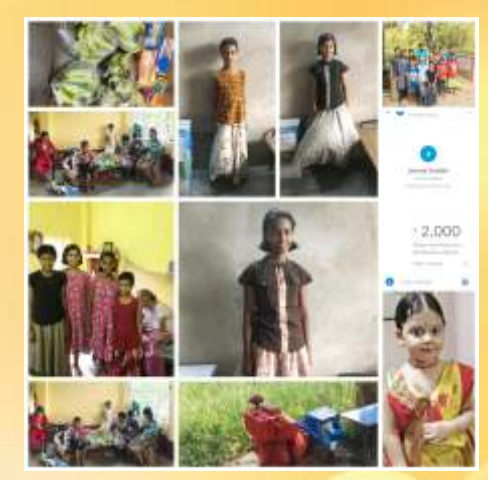
Alliance Club of Jagriti, District 101 bread, butter, toffees, milk and banana along with medicine and ration for children and care takers of Ramkrishna Mission, Nodakhali.