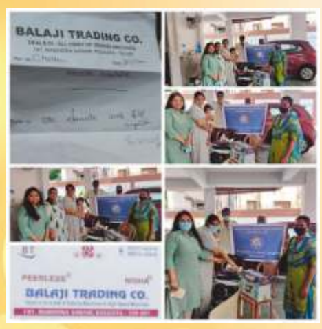
Alliance Club of Jagriti, District 101 donated a sewing machine to a needy woman from Kakurgachi for tailoring work.